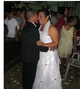
A dance they waited 20 years for