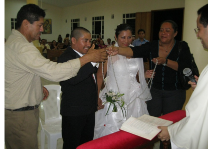
Witnesses bind couple with a wedding rosary

Jun 23-Jul 3 to Chacraseca Music Camp Church of the Valley, Murrieta, CA